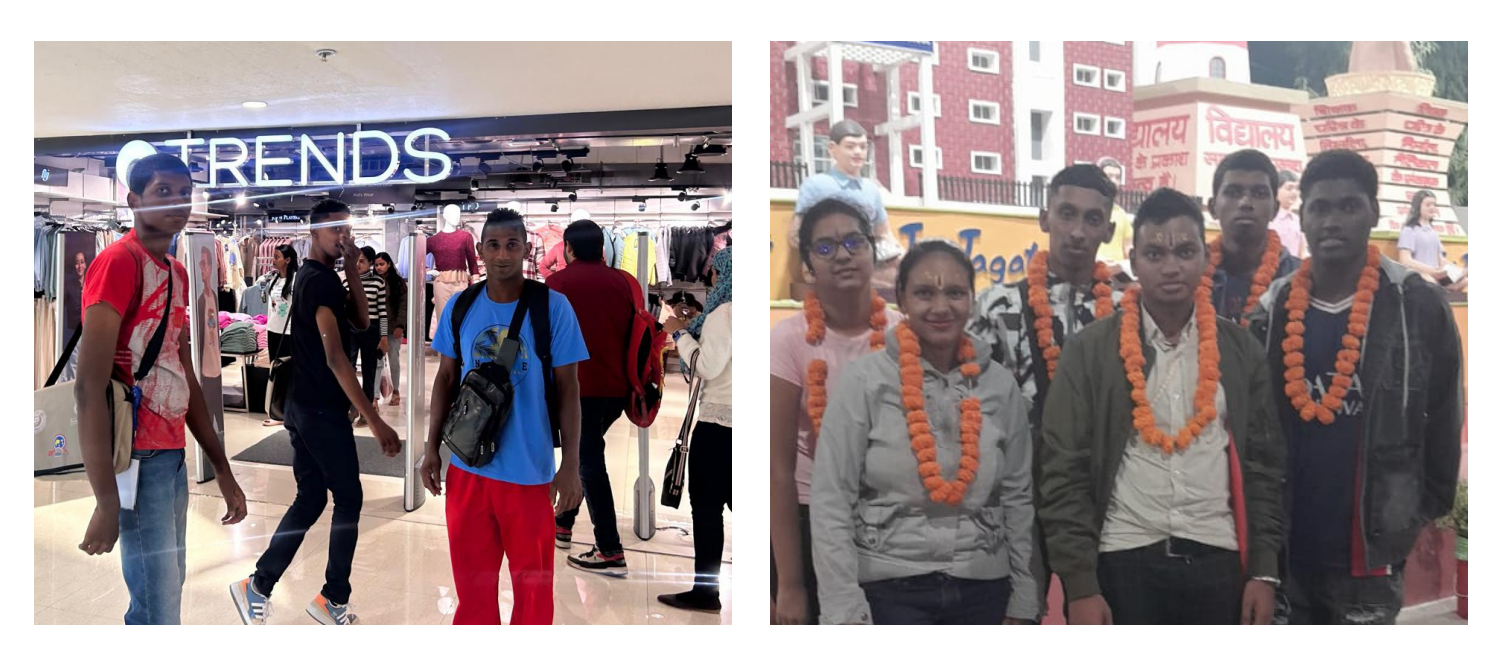
Trends Shop in Lucknow and City Montessori School